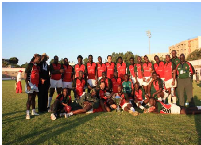
National 15's team posing with the runners up trophy at the concluded Africa Rugby Confederation Trophy Tournament held in Morocco