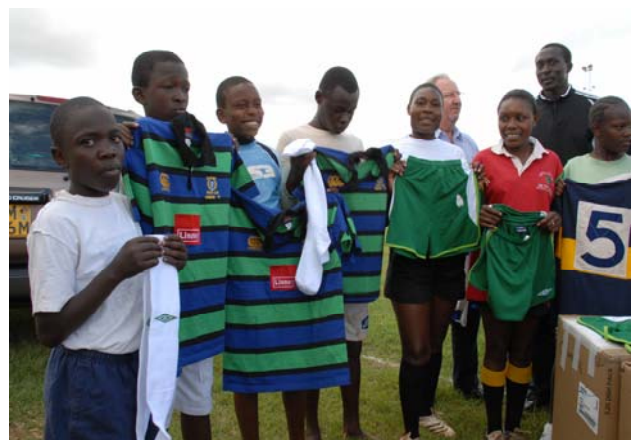
Patrons Society Of Kenya Donating kit to KRFU.