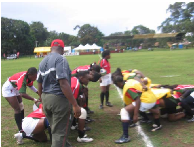
Women's 15's team warming up before clashing with Uganda in last years Elgon Cup first leg